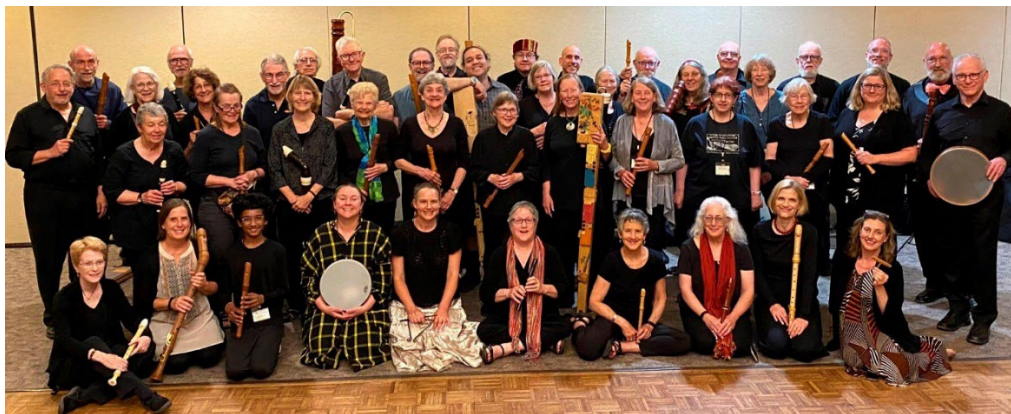
Photo below of the SFEMS Recorder Workshop Orchestra & Faculty, July 28, 2023